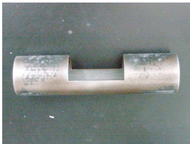
FIG. 2 Cylinder Configuration

NOTE 2—An adequate specification or other agreement between the purchaser and supplier requires taking into account the variability between rolls or pieces of pile yarn floor covering and between specimens from a roll or pieces of pile yarn floor covering to provide a sampling plan with a meaningful producer's risk, consumer's risk, acceptable quality level, and limiting quality level.